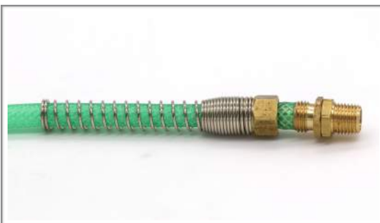
Nickel-plated-brass reusable fittings