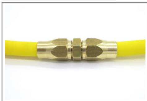
Splicer - 3/8" & 1/4"

Reusable Fittings allows quick repairs on the job site