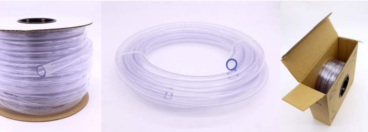
BV012014015-C-N: Braided Vinyl 1/2" OD, 1/4" ID, 15ft, Cut Case, NSF372