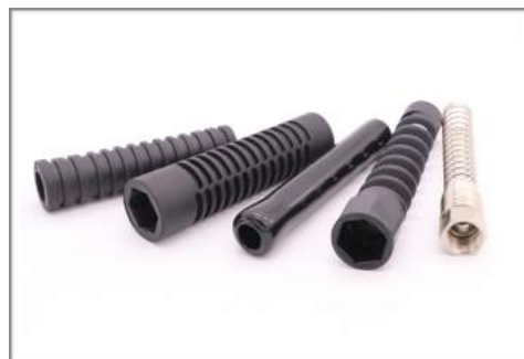
Wide selection of bend restrictors